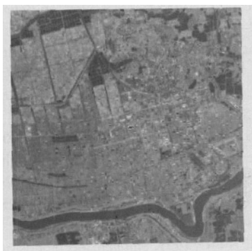
Fig. 2 Original TM image

The original image used in the experiment is a Landsat TM image with the size of 250 \times 250 in a given area of Wuhan (capital of Hubei Province), China (Fig. 2).